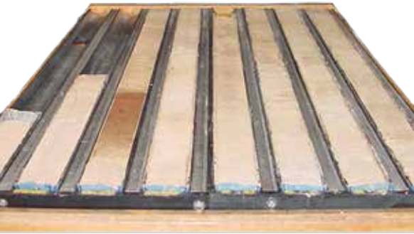
During the PETM, foraminifera quickly died out and could no longer form any sediments. In drill cores – here a photograph by palaeoclimatologist James Zachos – this is visible as an abrupt, dark-brown colouration of the otherwise chalky-white sediment layers.

Oceans heat up comparatively less in warm periods, but instead a lot of heat is transported from the tropics to the poles. Researchers plan to investigate this process in the framework of several VeWA subprojects.